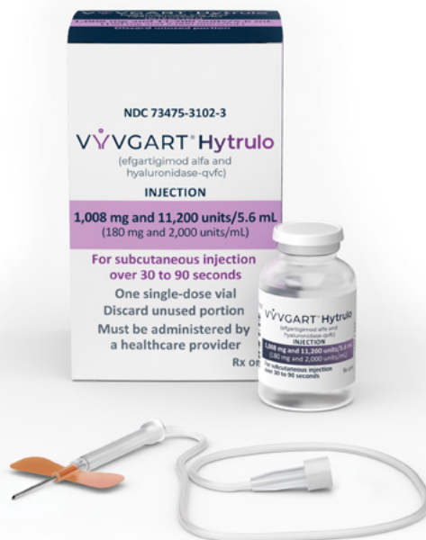
Not actual size

Before you leave, make sure to confirm or schedule your next appointment. If this is the last injection of your treatment cycle, you may want to have a plan in place with your doctor for symptom tracking.