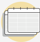
Your personalized break is your time off between receiving treatment cycles